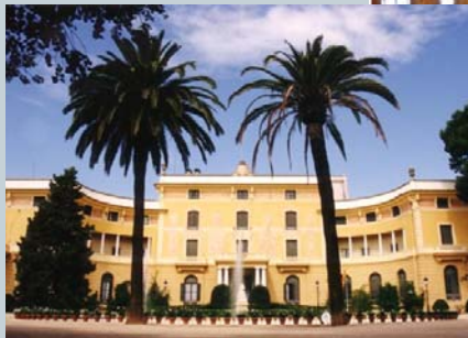
(Pedralbes Palace XVII Century)